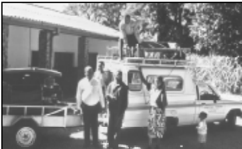
On the way to an outreach.

The farmers and farm labourers still invite us cordially and urgently. We have never been refused permission to work on the farms. We even visited various farms in the Karoi District. The farmers as well as the farm workers find present circumstances very difficult. It seems that people are more open to the Gospel as a result.